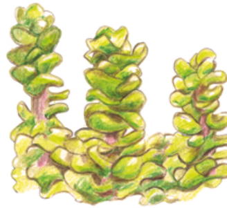
c. 5 x actual size

This is one of the most common liverworts of Scotland's rainforest. It is medium sized and forms compact mats with small, rounded leaves. It loves wet, humid conditions and can be found all year round.