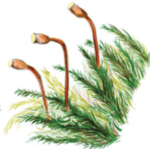
c. 2 x actual size

This moss is characteristic of Scotland's rainforest, mainly found on tree trunks and boulders, forming dense mats. On closer inspection, you'll see its tree-like growth form, unbranched near its base and becoming branched above. Look for the orange/brown capsules that grow on long stalks and release spores.