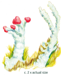
c. 2 x actual size