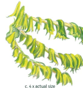
c. 4 x actual size