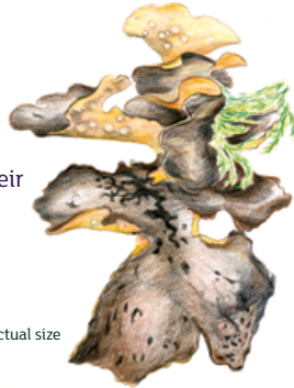
c. 2 x actual size

The stictas are a type of dark leafy lichen, which can look more like fungus growing on the tree than lichen. However, look underneath their 'fleshy' lobes to find a pale surface with small spots/pores. When wet or if rubbed, these lichens have a fishy smell, hence their 'stinky' name!