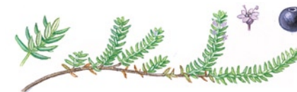
K Crowberry Empetrum nigrum

This evergreen, heather-like shrub is regarded as an upland species but it grows here at relatively low altitude because of the exposed, almost sub-arctic climate of Caithness. It has needle-shaped leaves and tiny, easily overlooked flowers that ripen into bitter, crow-black berries.