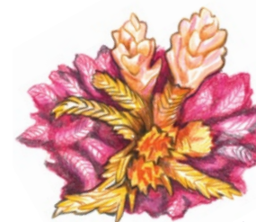
I Bog moss Sphagnum species

Bog mosses are arguably the most important plants of Munsary Reserve because their dead remains form the peat of which Munsary is built. They grow less well in the 'mineral soil' of the farmland by the path, but you may spot green lawns of bog moss in some of the ditches.