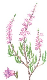
C Ling heather Calluna vulgaris

Beside the track, there are extensive areas of ling heather, arguably the true 'Scottish heather'. It is a bushy shrub with leafless stems but many short side shoots packed with tiny, needle-like leaves. Its small, pink, bell-shaped flowers appear in August and September.