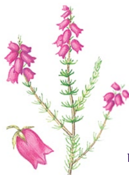
E Bell heather Erica cinerea

This is probably the commonest of three heather species at Munsary. The dark reddish-purple, tubular flowers appear in July, before ling heather is fully in flower. Its needle-shaped leaves are arranged in knot-like clusters up its shrubby stem.