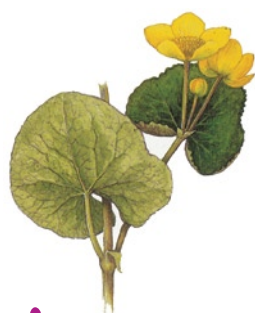
A Marsh marigold Caltha palustris

There are all sorts of interesting wetland and bog plants along the track that leads to Munsary Peatlands Reserve. They include: