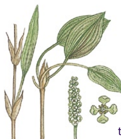
G Bog pondweed Potamogeton polygonifolius

The oblong leaves of this pondweed float on the surface of ditches with running water by the track or lie submerged just below the water surface. The plants do not mind that the water is stained brown by peat and quite acid, but do not like too much cattle trampling.