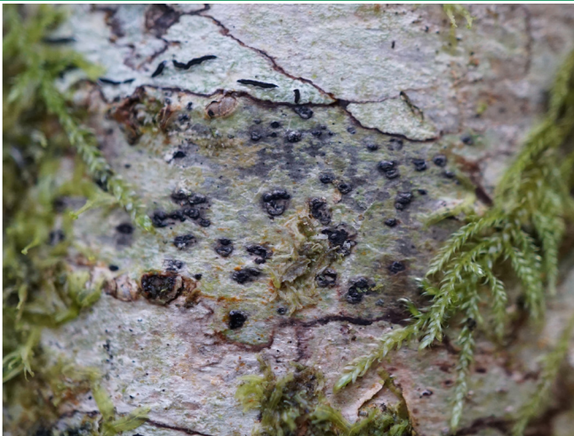
A Comma Lichen Arthothelium ruanum

Thallus: creamy white, pale grey, brown-grey or olive grey, sometimes with a dark prothallus Apothecia: irregular or almost stellate blotches to 2mm, often breaking down in places and sometimes partially covered by bark cells Similar species: can be confused with Arthonia radiata but this species usually has a darker thallus, microscopic examination needed to be sure Notes: uncommon