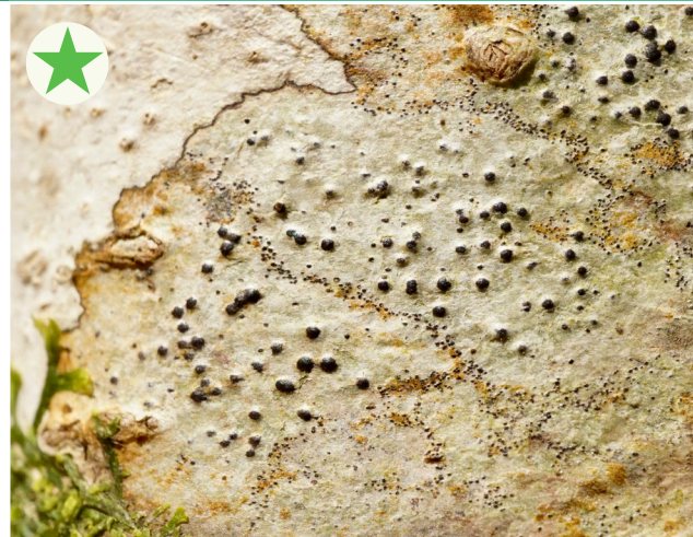
A Pox Lichen Pyrenula laevigata

Thallus: whitish, silvery or cream coloured Perithecia: black conical, volcano-like, perithecia to c0.6mm. Also present are even smaller dots (pycnidia), especially on the margins when in mosaics where they look like stitching Notes: rare. Forms complex mosaics with it and other similar species, smaller and whiter than other Pyrenula species. Strongly associated with temperate rainforest habitat