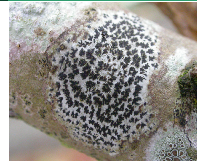
An Asterisk Lichen Arthonia radiata

Thallus: whitish, sometimes greenish and usually with a brown prothallus Apothecia: asterisk-like or rounded black splotches, sometimes partly covered by bark Similar species: other Arthonia species, needing microscopic examination to be sure Notes: common