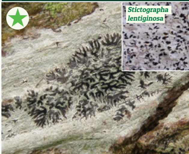
Dark-spored Script Lichen Phaeographis dendritica

Thallus: silvery to whitish or greenish grey, smooth Apothecia: abundant lirellae, usually flat, broad and branched with pointed tips, that sit level with the surface of the thallus. They have no obvious margin but they look like they're bursting through the bark, the edges peeling back to reveal the dark surface which is sometimes pruinose Similar species: other Phaeographis and Graphis species (see above), often needing microscopic examination to be sure Notes: common