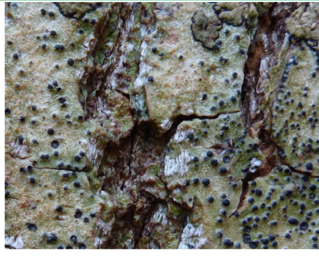
A Pox Lichen Pyrenula macrospora

Thallus: thick and waxy, pale brown to olive with tiny white flecks over the surface and a dark prothallus Perithecia: black conical, volcano-like, perithecia to 1mm diameter, with a minute pore-like hole in the top sometimes visible Notes: common. Forms complex mosaics with it and other similar species e.g. Enterographa crassa each individual separated with a black line (prothallus)