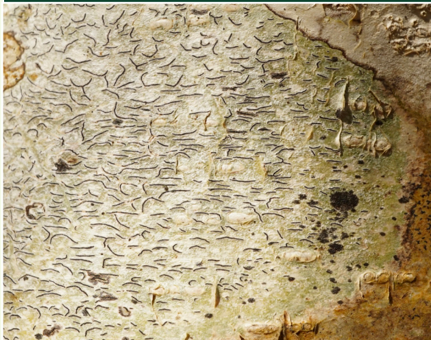
Common Script Lichen group Graphis scripta group

Thallus: whitish to greenish grey, usually smooth Apothecia: lirellae, variable in size and shape, sometimes straight, sometimes curved or branched, that sit more or less level with the surface of the thallus. They have a slightly raised margin which can be closed or open to reveal a black-brown surface inside, sometimes with pruina Similar species: other Graphis and Phaeographis species (see below) Notes: common