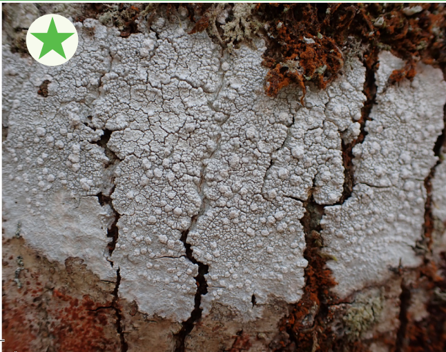
A Wart Lichen Lepra multipuncta

Thallus: pale grey, sometimes greenish, can be thin or thick, often lumpy and cracked Apothecia: usually hidden underneath a mound of soredia Soredia: soredia obscure the apothecia so appear to be in discrete mounds on the thallus, usually starkly white contrasting strongly with the thallus Similar species: other Lepra species; microscopic or chemical examination can be needed for confirmation but the combination of features described here are usually reliable. The very similar L. amara has a bitter taste Notes: common