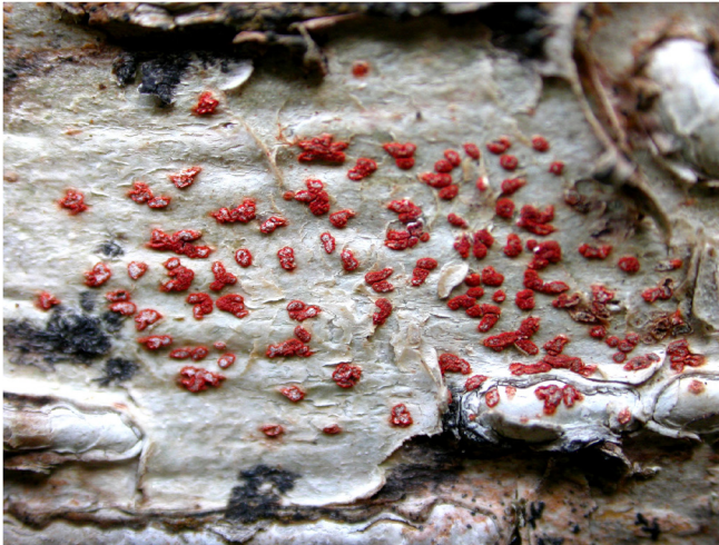
An Asterisk Lichen Coniocarpon cinnabarinum

Thallus: pale grey to fawn often with a brown prothallus Apothecia: asterisk-like or rounded, sometimes branched reddish brown flecks with cinnamon coloured pruina on the margins when fresh Similar species: easiest to identify when the fresh fruiting bodies have the cinnamon coloured pruina, but even then there are very similar species (e.g. Arthonia elegans ) and microscopic confirmation is needed Notes: common