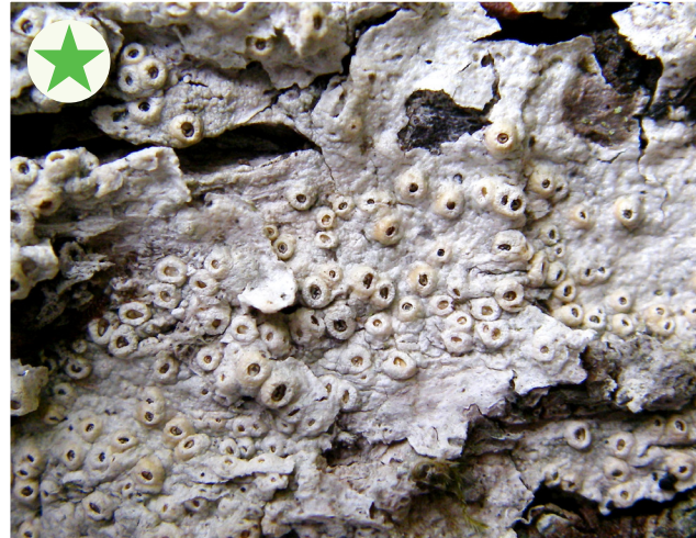
Barnacle Lichen Thelotrema lepadinum

Thallus: whitish, pale grey or creamy coloured, often lumpy Apothecia: abundant, small raised rounded warts growing in the thallus with a thick outer rim and a thin, papery inner rim that gives a barnacle-like appearance Notes: uncommon (but common on some sites). Found on a wide range of trees usually in old woodlands, also in the Lobarion community (Guide 1)