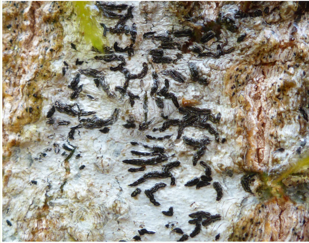
Furrowed Script Lichen Graphis elegans

Thallus: whitish to greenish grey, often with a brownish or creamy tinge Apothecia: short lirellae, usually straight, sometimes branched, that sit raised above the surface of the thallus. They have a prominently raised margin which is furrowed or ridged when well developed, and is generally closed and slit-like Similar species: other Graphis and Phaeographis species (see below) Notes: common